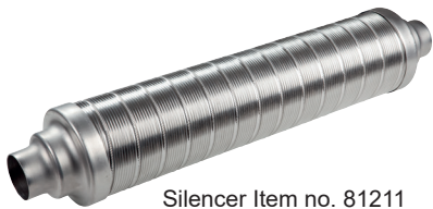
Silencer Item no. 81211