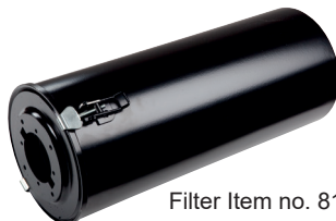
Filter Item no. 81210