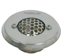
Item no. 12652