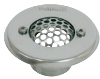
Item no. 12650