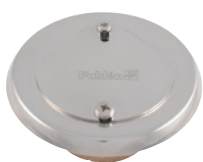
Item no. 12673

12673 Bronze, with acid-proof stainless steel front AISI 316L. For concrete and liner pools. Inside thread 1 1/2".