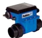
Item no. 141650-01