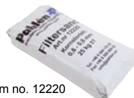
Item no. 12220