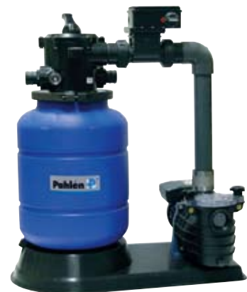
Complete unit with filter, pump and electric heater.