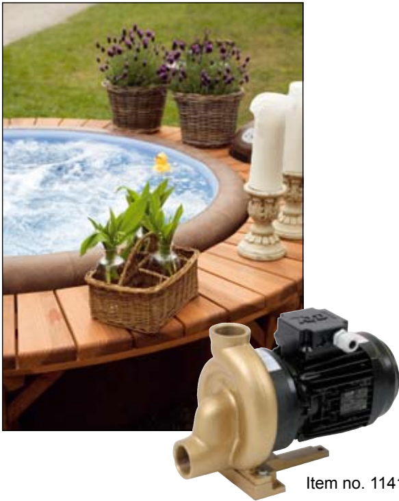
Item no. 11416