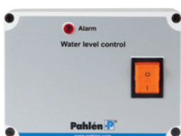
Item no. 11250

112505 Non leak flange for cable of level control.