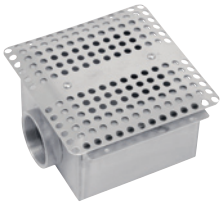
Item no. 125935