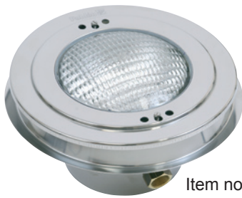
Item no. 12250