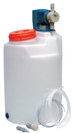
Item no. 41330 Flocculation station incl. tank and pump